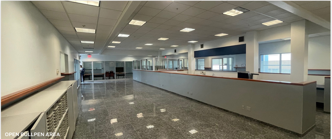
OPEN BULLPEN AREA