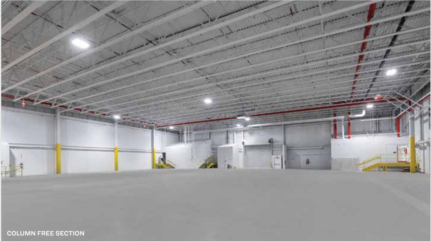
COLUMN FREE SECTION