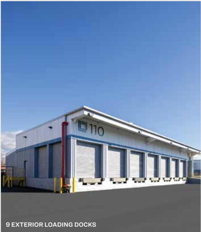
9 EXTERIOR LOADING DOCKS