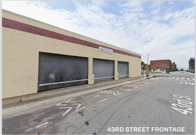
43RD STREET FRONTAGE