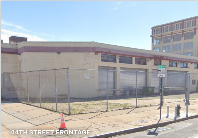
44TH STREET FRONTAGE