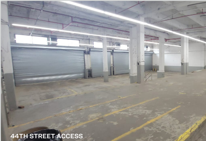
44TH STREET ACCESS