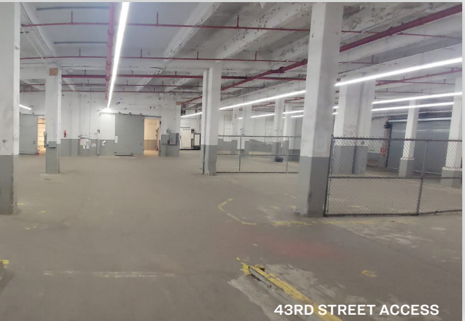
43RD STREET ACCESS