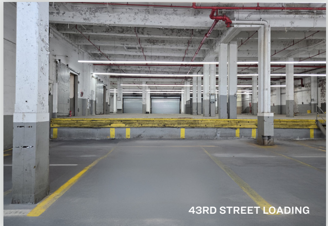
43RD STREET LOADING